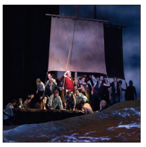
▶ A scene from the Flying Dutchman opera

A premiere of a new joint Ukranian-German production of Richard Wagner's famous opera "The Flying Dutchman" was staged in Donbass Opera with the support of SCM and the Embassy of Germany in Ukraine.