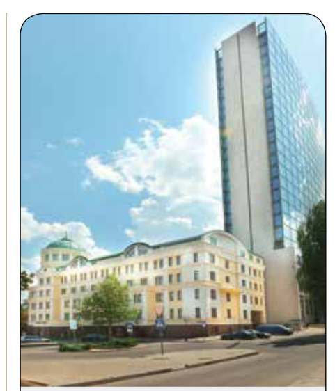
Donbass Palace and Pushkinsky Complex in Donetsk

serious representatives of suppliers who recorded losses in their notebooks and examined cleanliness of track left by the competitors' harvesters."... Read more